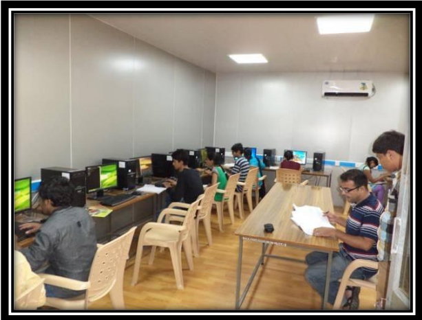
UG Students Performing Practical in the Lab