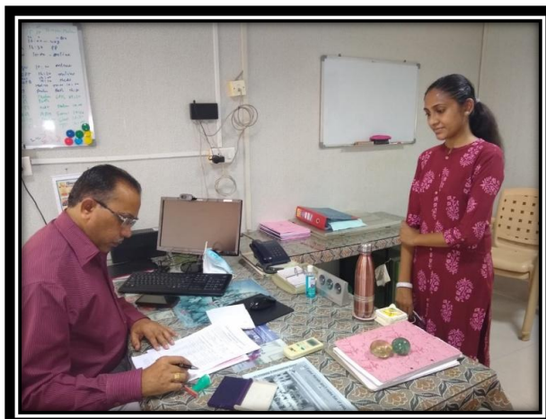
PG Students Research Advisory