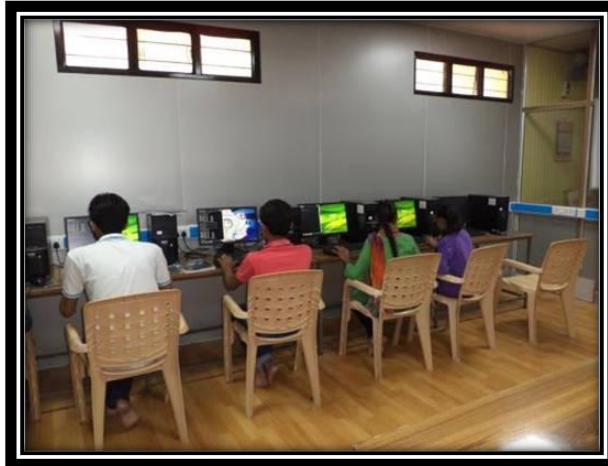
UG Students Performing Practical in the Lab