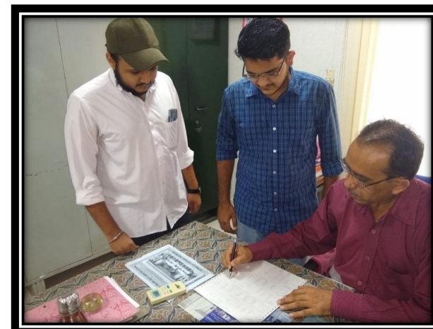
PG Students Research Advisory