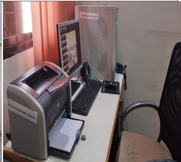
Printer & Computer