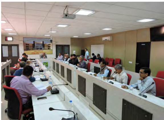
Library Committee Meeting