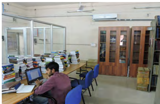
Air conditioned Theses Room