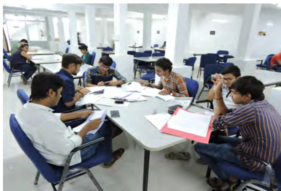
Air condition Reading Room