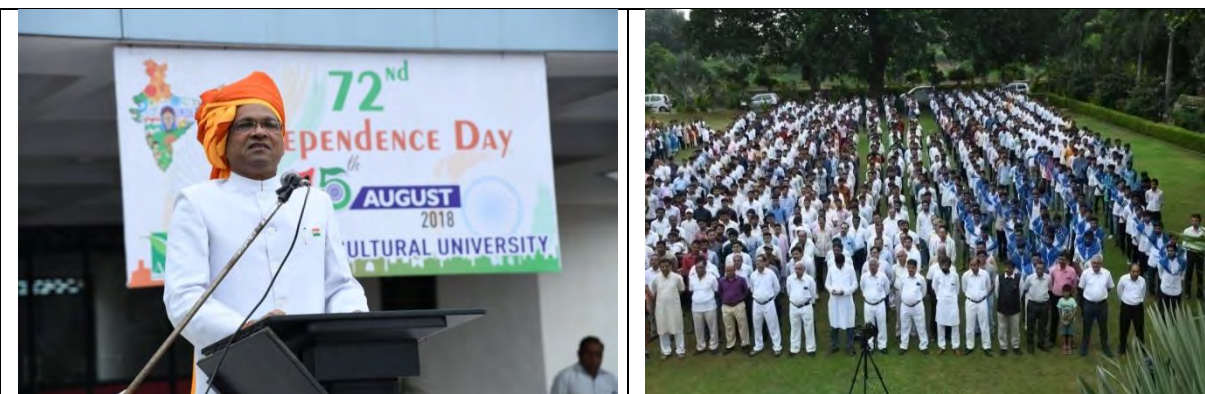
Celebration of 72 nd Independence Day