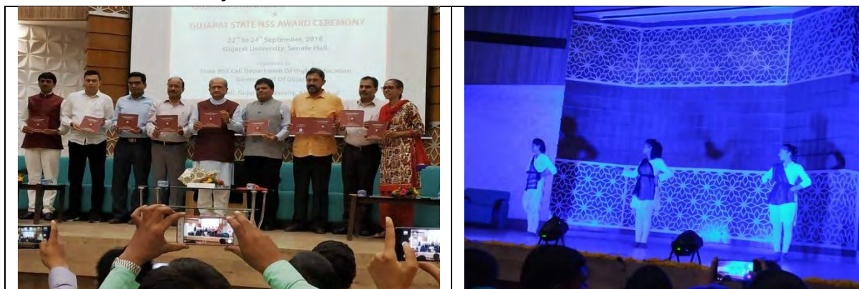
‘National Service Scheme Day’ at Gujarat University, Ahmedabad