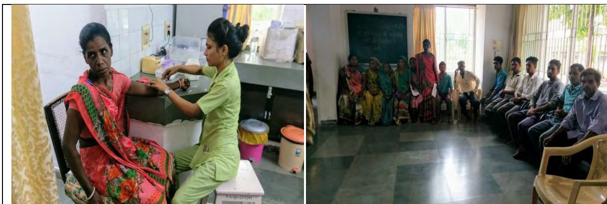
Health Check up Camp for University Labour