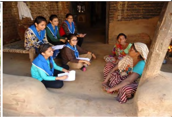
Special Camp at Thaledi village