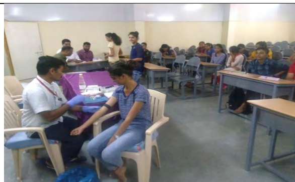
Thalassemia Screening Programme