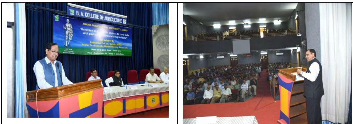
Guest lecture on Mahatma Gandhiji