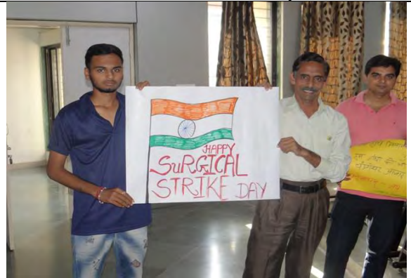
Surgical Strike Day