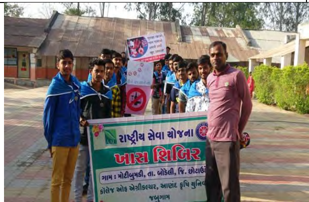
Special Camp at Moti Bumdi village