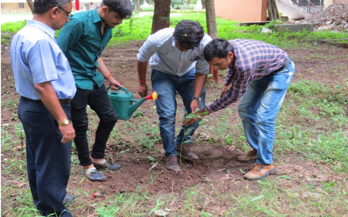
Tree plantation by NSS volunteers