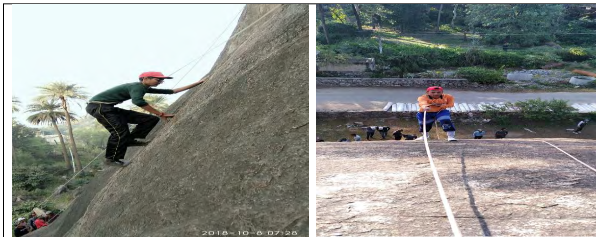
Basic Rock Climbing Camp at Mount Abu

Basic Rock Climbing Camp for male students of Anand Agricultural University was organized during October 01-10, 2018 at Swami Vivekananda Mountaineering Institute, Mount Abu by the Director of Students' Welfare, AAU, Anand. 80 students from various colleges participated in the Camp. .