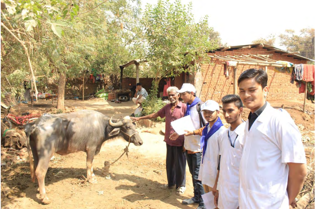
Animal survey for mastitis & infertility in animals in Navli