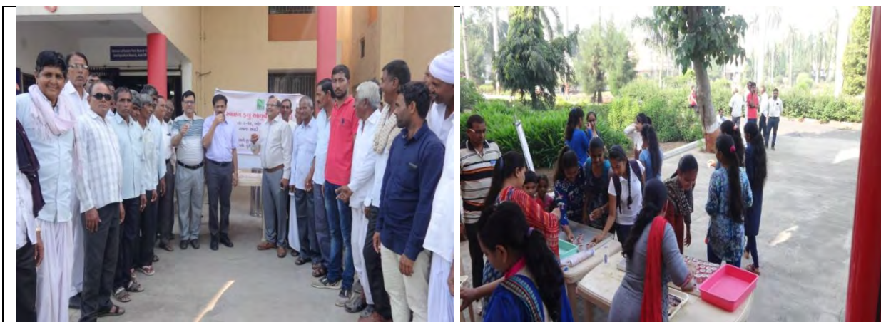
'KAVA' distribution for prevention of H1N1