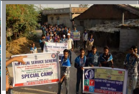
Special Camp at Moti Sarsi Village