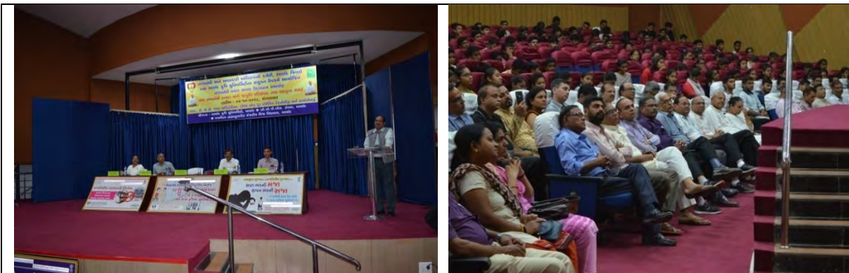
Celebration of Anti Addiction Week