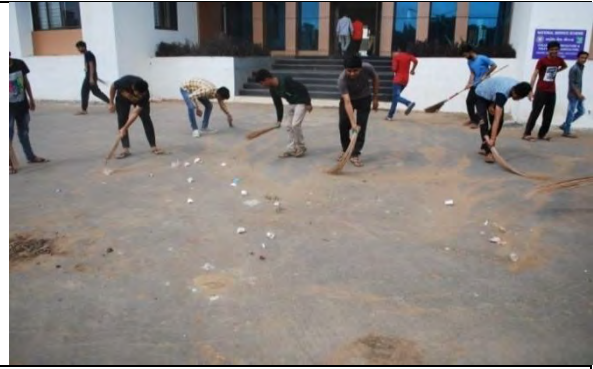
Swachh Bharat Abhiyan