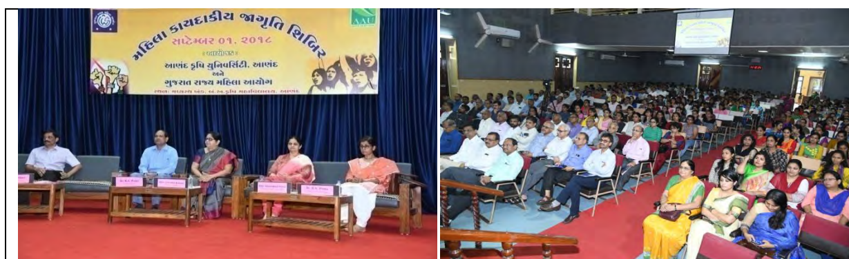
Women Legal Awareness Programme