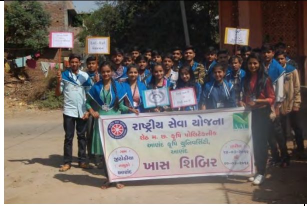
Special Camp at Jitodiya village