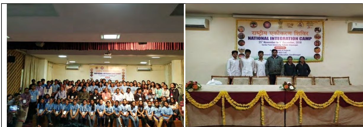
National Integration Camp

National Integration Camp was organized during 25/11/2018 to 1/12/2018 at Sardar Patel University, VV Nagar under National Service Scheme. 212 students of different Universities of 13 states were participated in the camp. Total, 5 students of Anand Agricultural University were represented to University. Students have participated in Yoga, Cultural Programmes and Lecture Series.