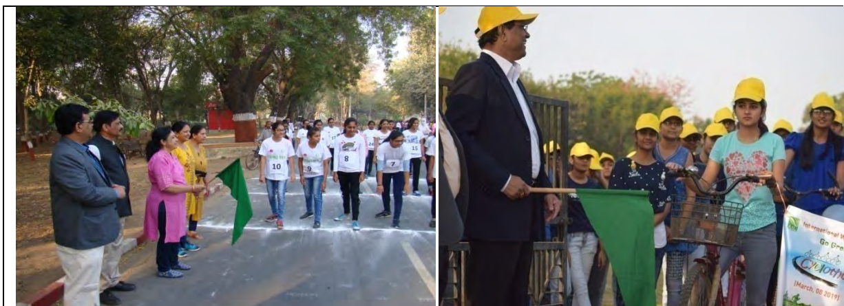
Celebration of International Women’s Day