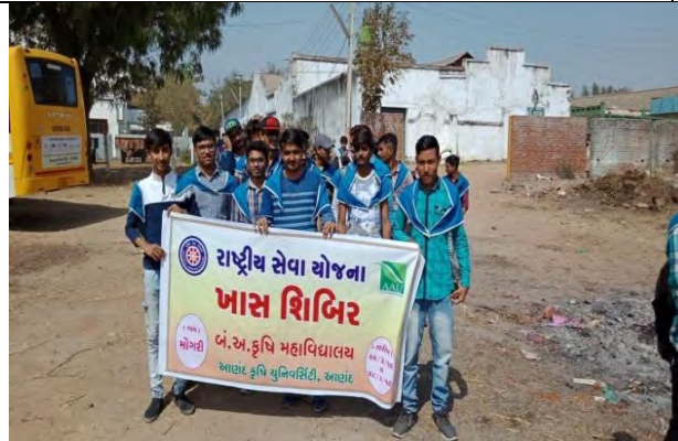
Special Camp at Mogri Village