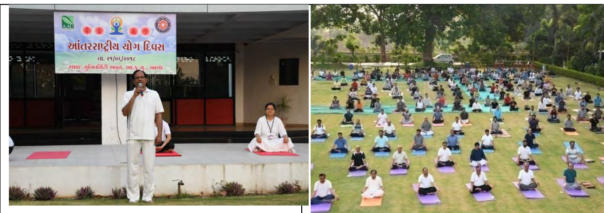
International Day of Yoga