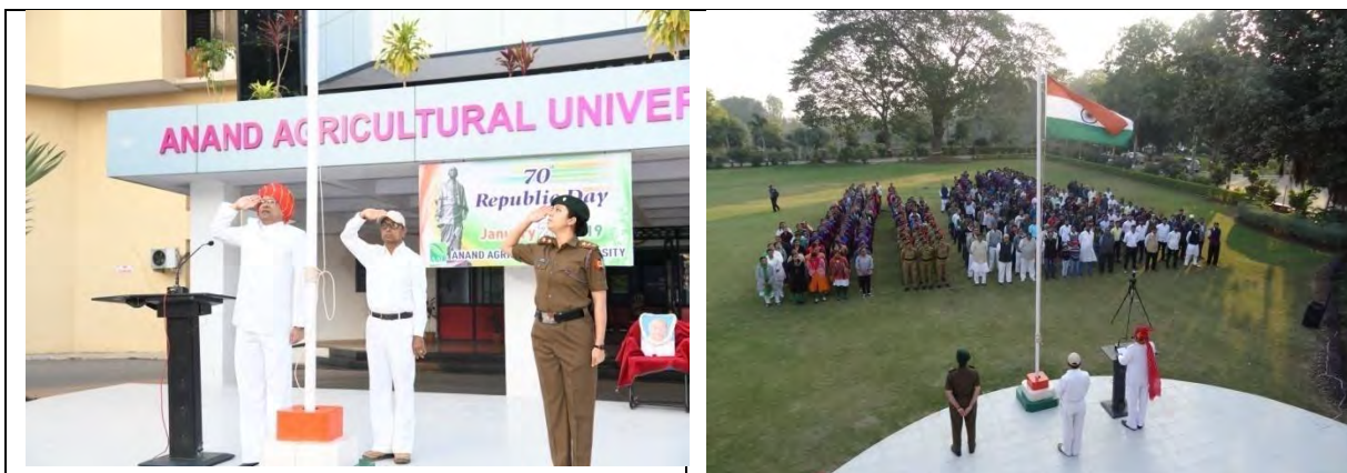
Celebration of 70 th Republic Day