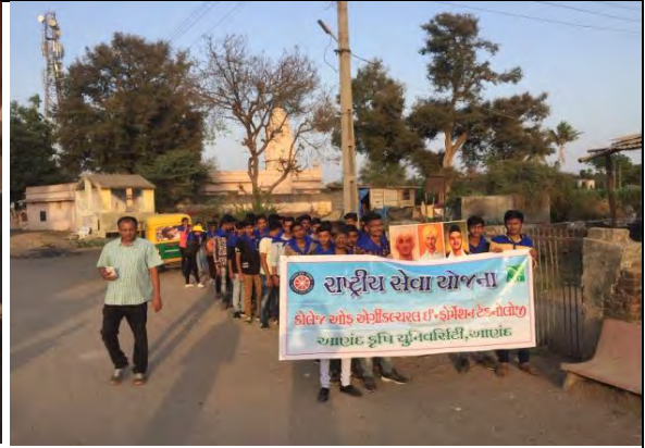
Special Camp at Sankhej village