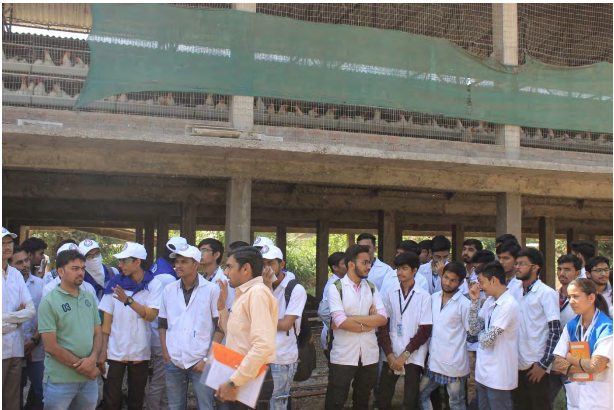
Visit to poultry farm during special camp