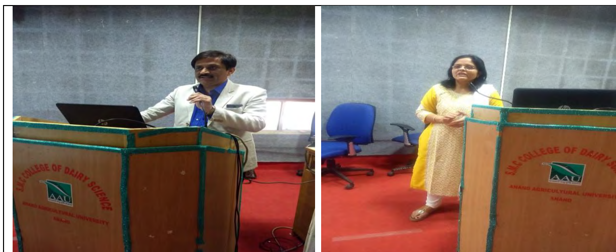
Guest lecture on 'Sexual Harassment of Women at Workplace'