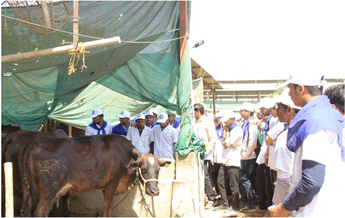
Visit to Cattle farm during special camp