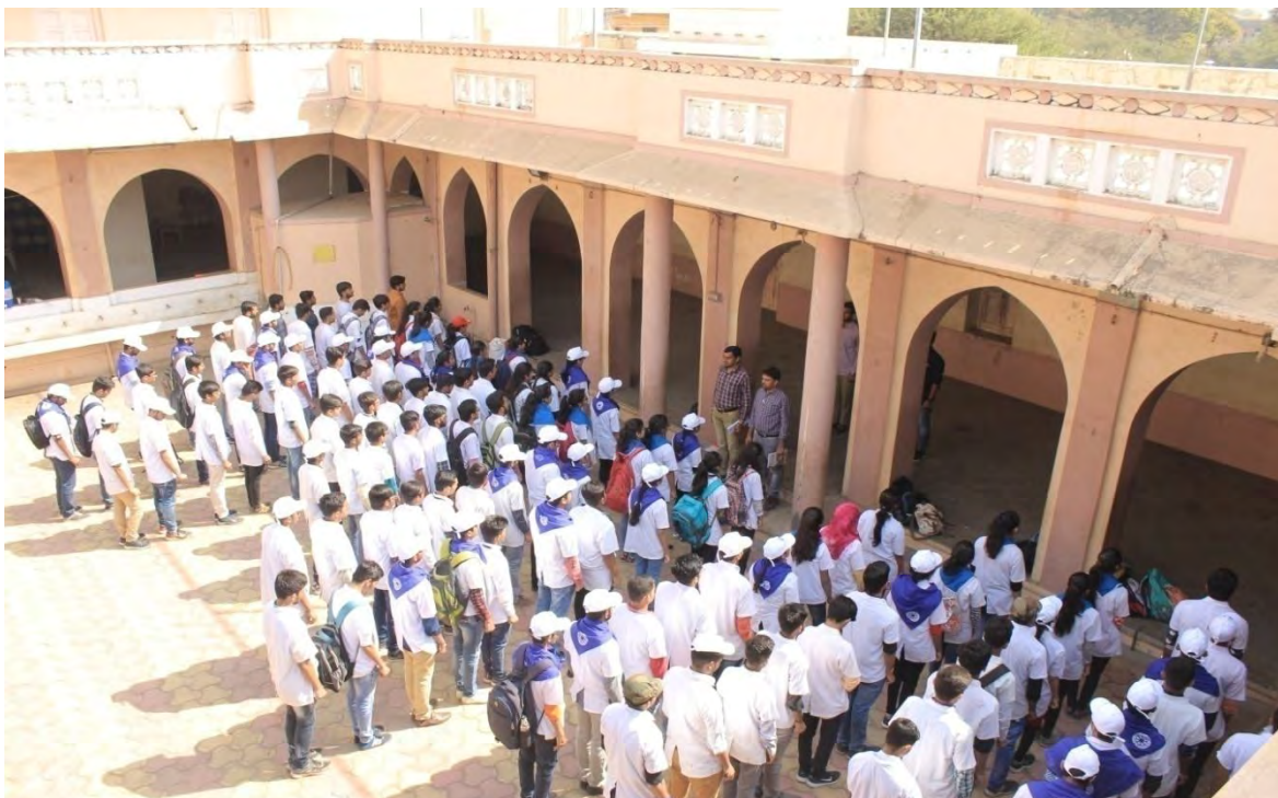
Praying NSS Song during special camp