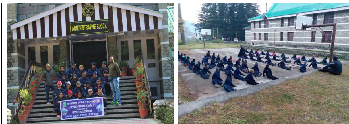
National Adventure Camp