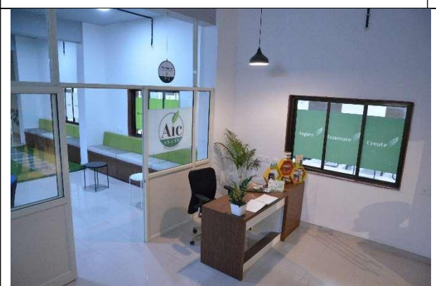
Welcome - Reception Area