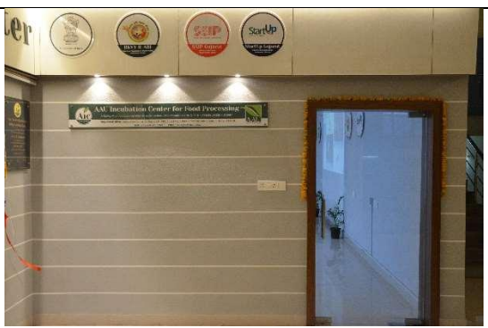
AIC Anand Entrance-Event space