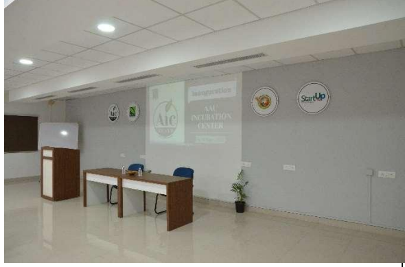
The Arena – Event & Actitvity space