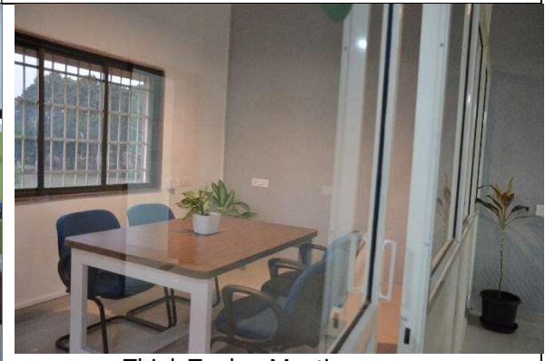
Think Tank – Meeting room