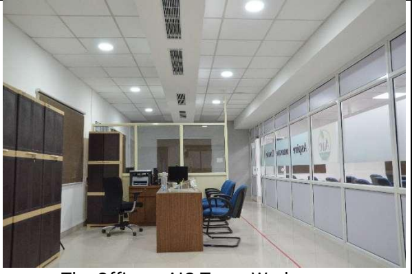
The Office - AIC Team Workspace