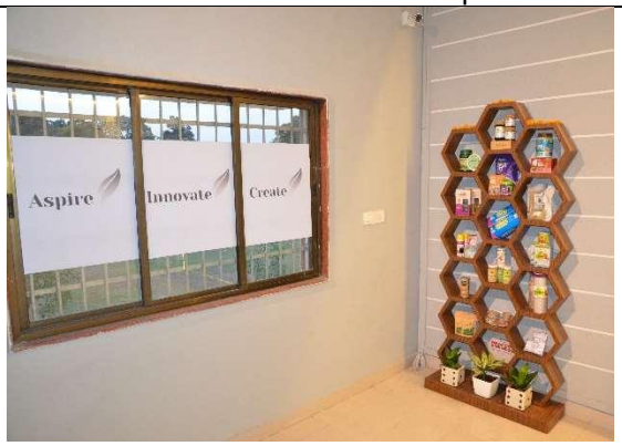
Startup's Product Display