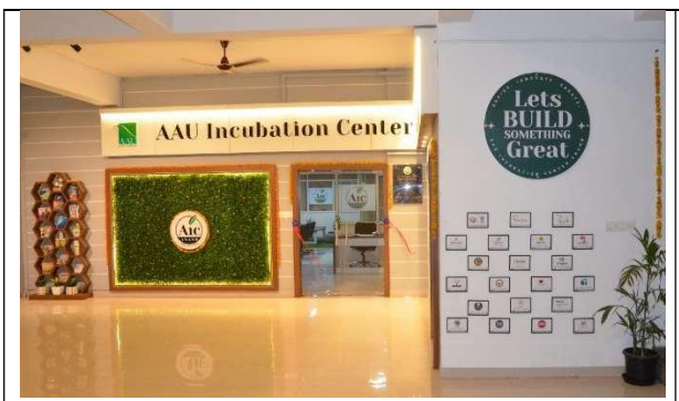
AIC Anand Main Entrance