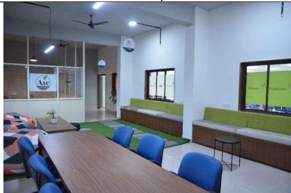
The Hive - Co-working space