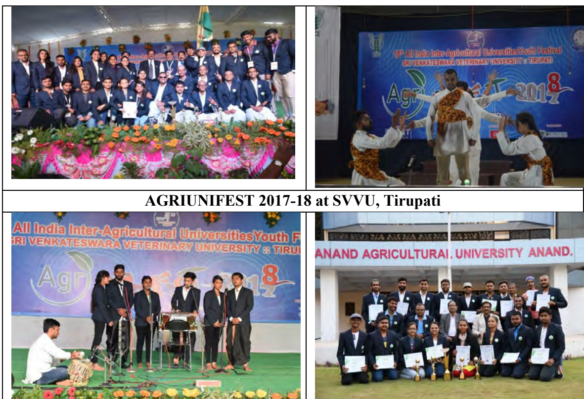
AGRIUNIFEST 2017-18 at SVVU, Tirupati