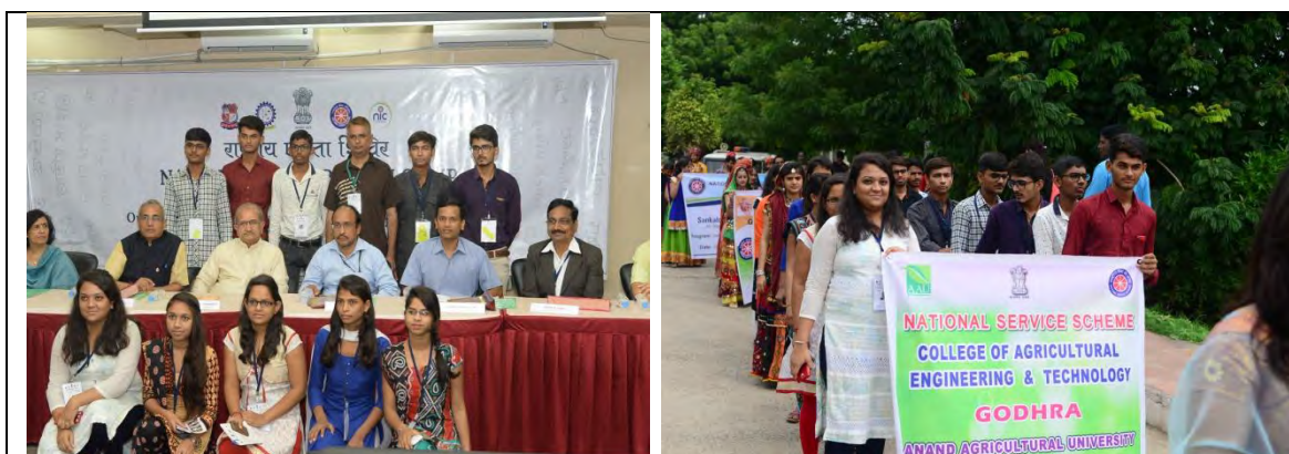
National Integration Camp at Ahmedabad