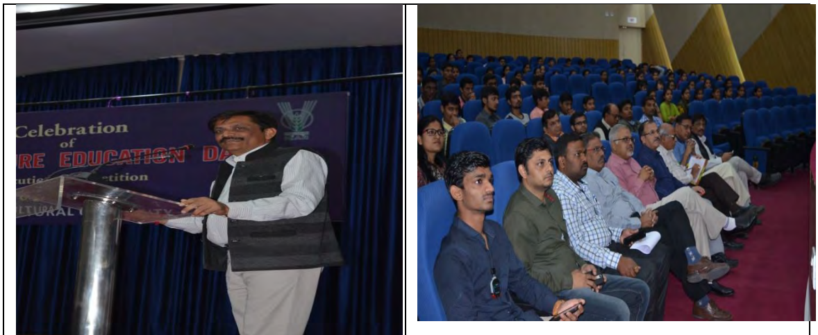
Agriculture Education Day

Anand Agricultural University celebrated 'Agricultural Education Day' on December 03, 2017. An Elocution competition was organized amongst the students on the topic 'Agriculture Education: Status and Prospects' for graduate and postgraduate students of Anand Agricultural University. Staff, Officers and students remained present on the occasion.