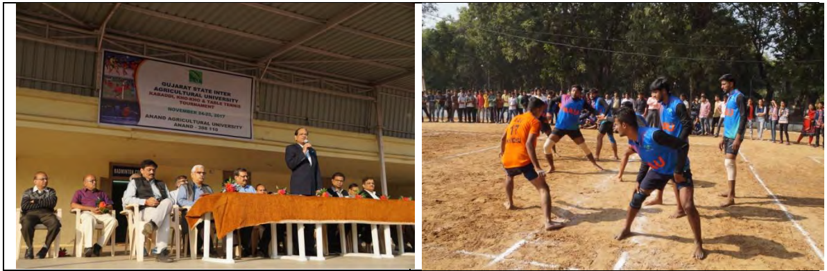
Gujarat State Inter Agricultural University Kabaddi, Kho-Kho, Table Tennis Tournaments