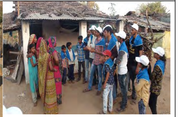
Special Camp at Doctor na Muvada village