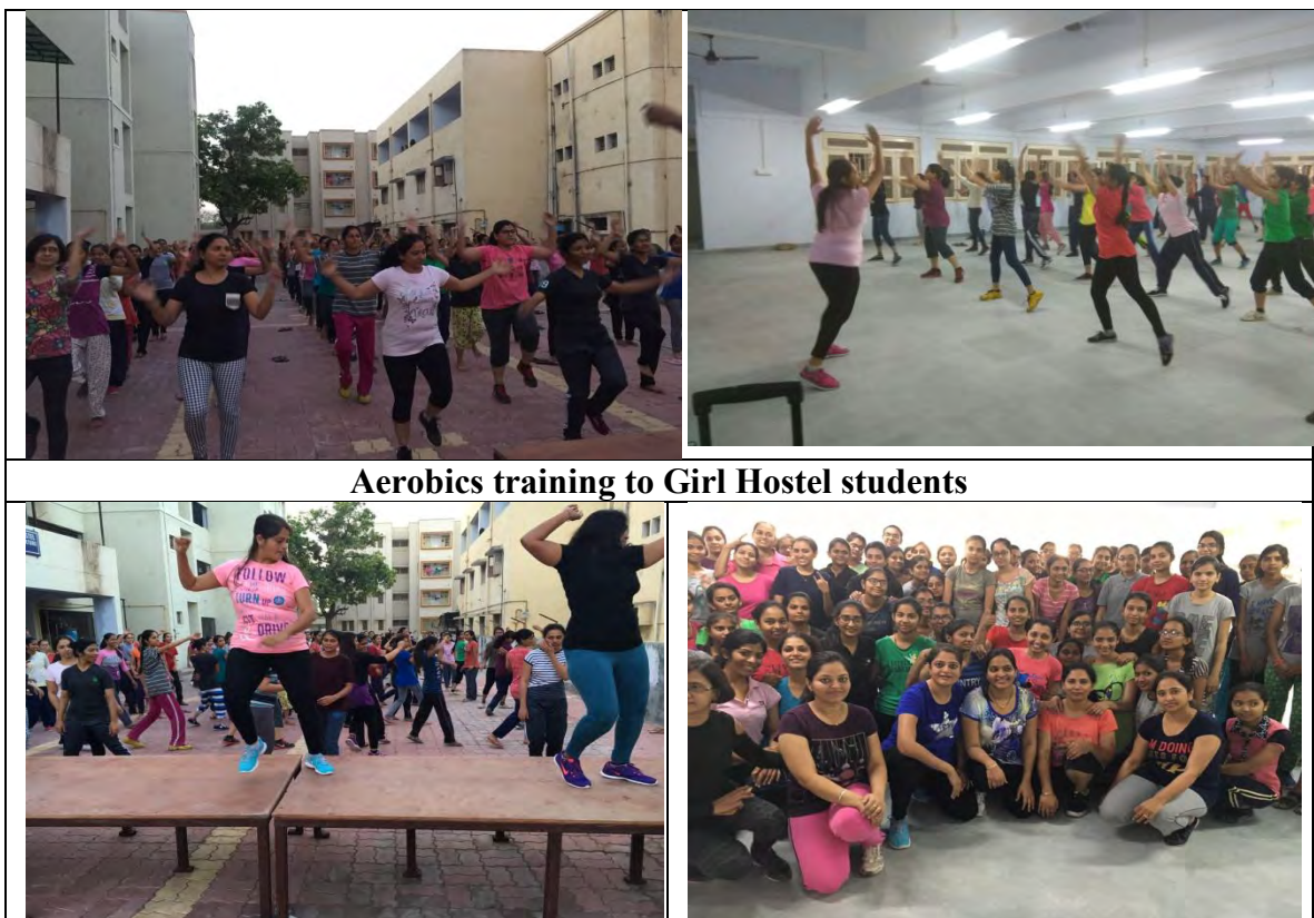
Aerobics training to Girl Hostel students