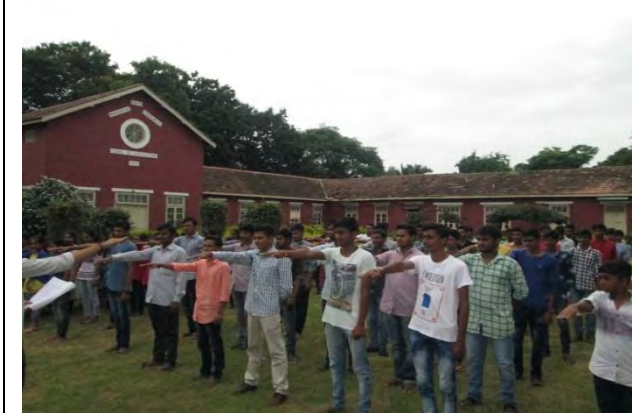
Pledge on New India Formation-2022