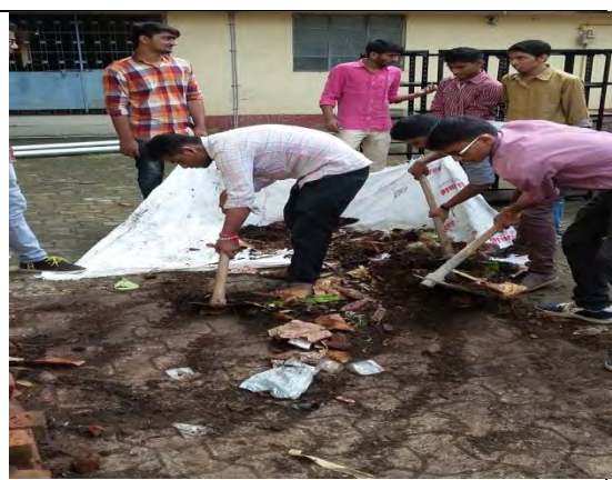
Swachh Bharat Abhiyan