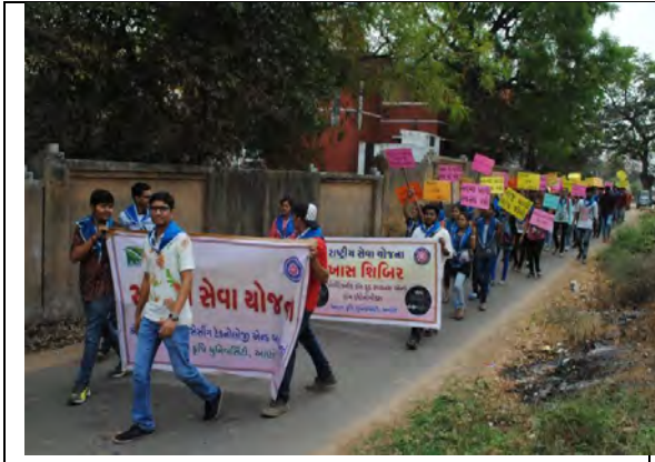
Special Camp at Vaghasi village