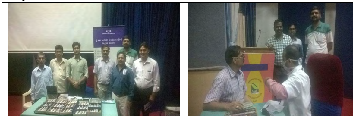
Eye Check up Camp

University, Anand. University officers, staff members, students and university residential were participated in the camp. Retina Check up, Color Vision, Refraction, Cataract and Glaucoma test were taken by Expert Doctors. Total, 235 persons took benefit of the camp.