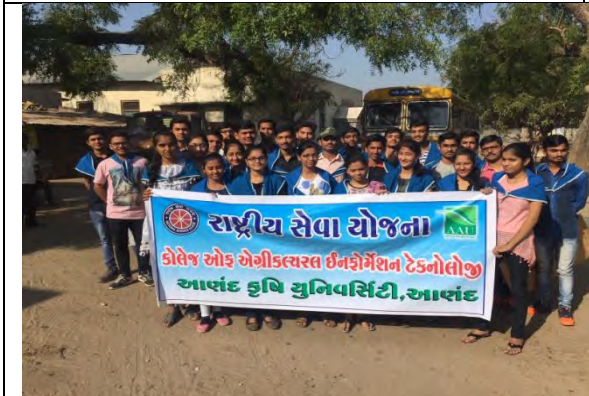
Special Camp at Sankhej village