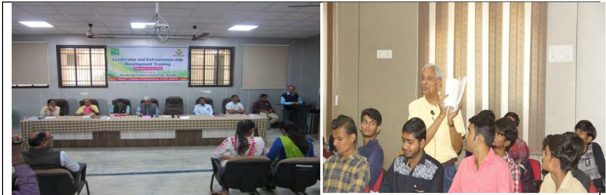
Leadership & Entrepreneurship Development Training Programme