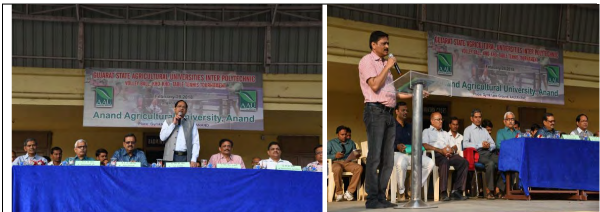
Gujarat State Inter Agri. University Polytechnic Tournaments at AAU, Anand

Gujarat State Inter University Polytechnic Volleyball, Kho-Kho and Table Tennis tournament 2017-18 was organized by AAU, Anand on February 28, 2018. Anand Agricultural University became Runners-up in Table Tennis.