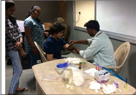
Thalassemia Awareness Programme