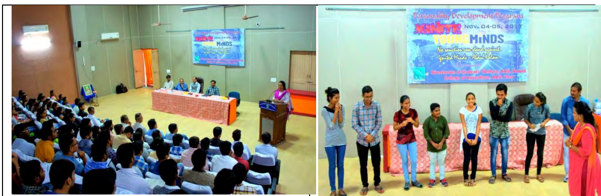
Personality Development Programme