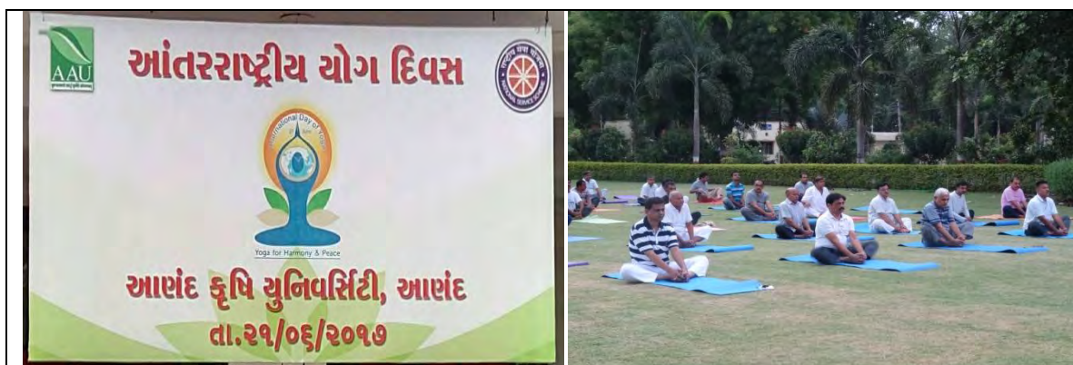
International Day of Yoga

Anand Agricultural University celebrated 3 rd International Day of Yoga on June 21, 2017 at University Bhavan. About, 400 people including University Officers, staff members, students and family members remained present. Yoga performed was as per yoga protocol and instructions by Yoga trainers. 45 minute programme was arranged as per the protocol suggested by Ministry of AYUSH, Govt. of India.