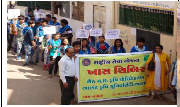
Special Camp at Napad village