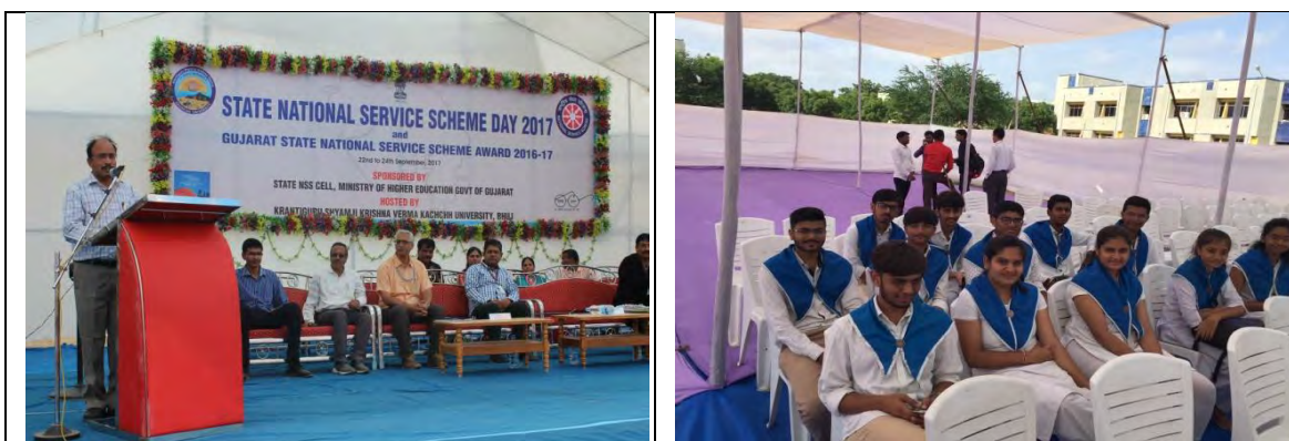
'National Service Scheme Day' at KSKVKU, Bhuj