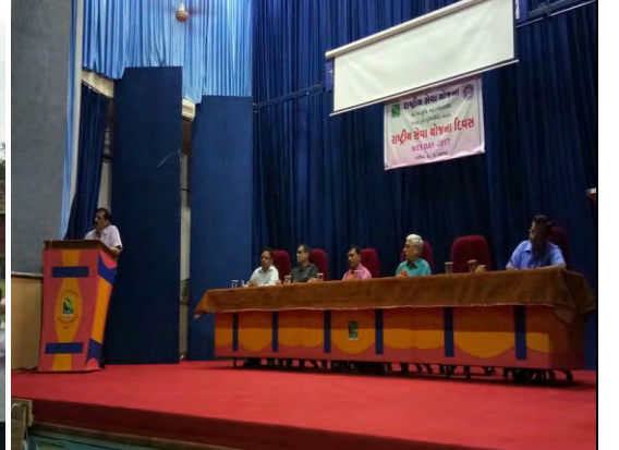
NSS Day Celebration