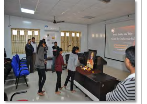
Swami Vivekanand Birth Anniversary