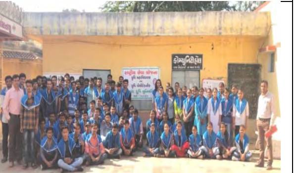
Special Camp at Siholdi village