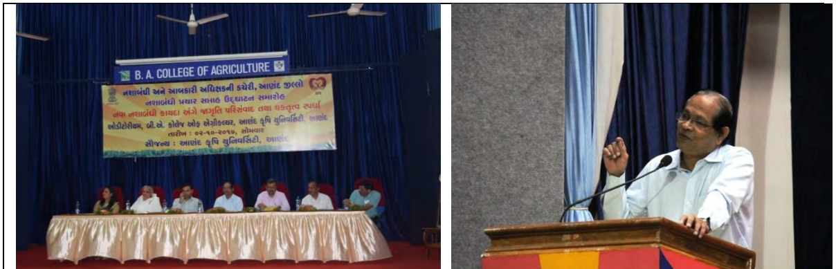
Anti Addiction Week