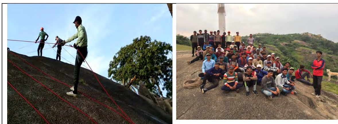
Mountaineering Basic Rock Climbing Camp

During the camp, theory lectures were included on Principle & Methods of Climbing and Rappelling, Trekking & Camp manner, Belays: types, methods & calls and Rack formation. Students also learned different types of belays and rappelling techniques like American side, Stomach and Side Rappelling.