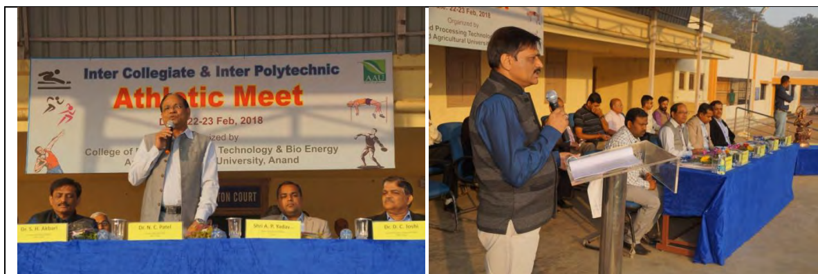
Inter Collegiate and Polytechnic Athletics