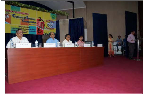
Inauguration of Inter Collegiate Cultural Competition