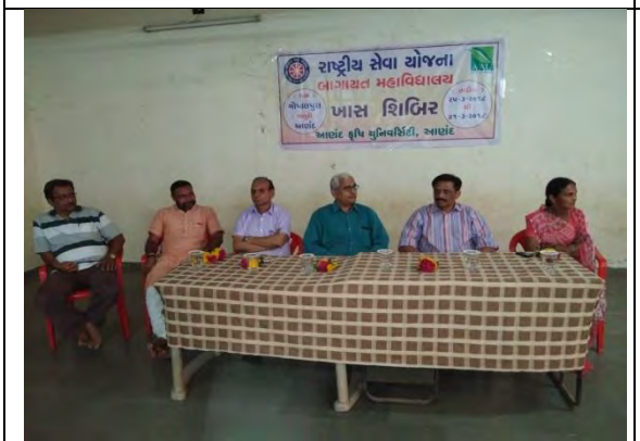
Special Camp at Gopalpura village