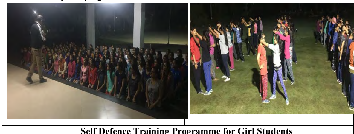
Self Defence Training Programme for Girl Students