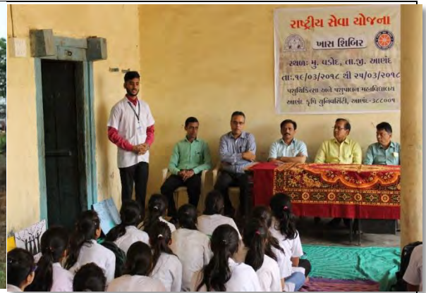
Special Camp at Vadod village