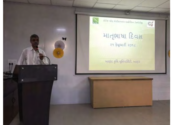
Mother Language Day