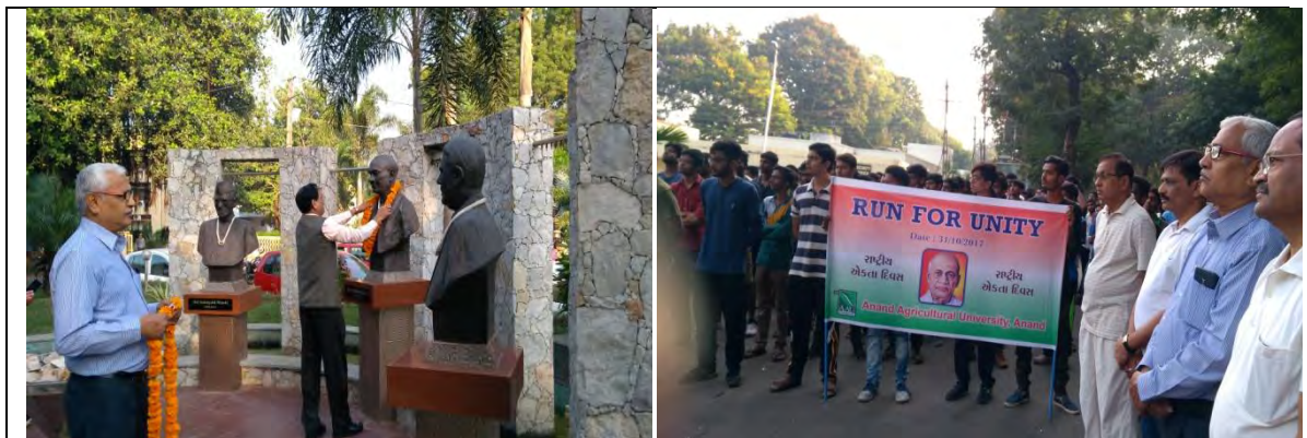
Sardar Patel Jayanti 'Run for Unity'