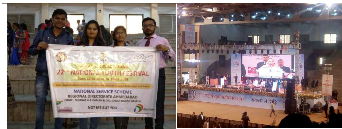
22 nd National Youth Festival 2018 at Greater Noida (U.P.)

Four NSS Volunteers of different Colleges of Anand Agricultural University participated in 22 nd National Youth Festival 2018 organized at Guatam Buddha University, Greater Noida, Uttar Pradesh during January 12-16, 2018.