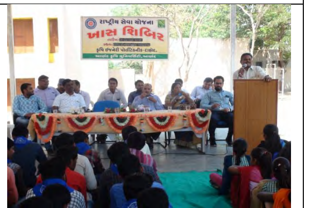
Special Camp at Moti Sarsi village