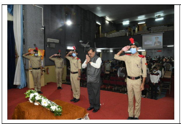
Hon. Vice chancellor paying tribute to Gen. Bipin Rawat and other martyrs