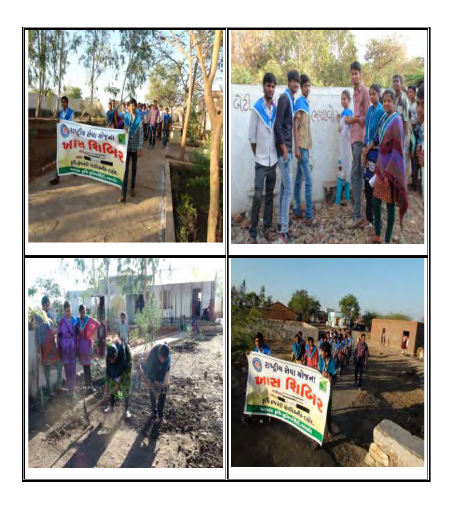
Rally & village survey, Painting wall Slogans and Garden Restoration