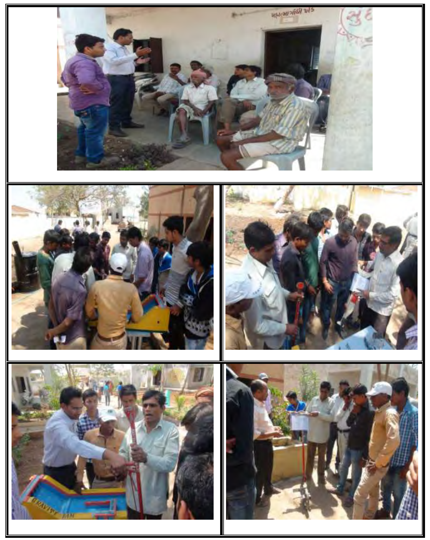
Farmer Awareness Day and Technology day celebration at NSS Special camp