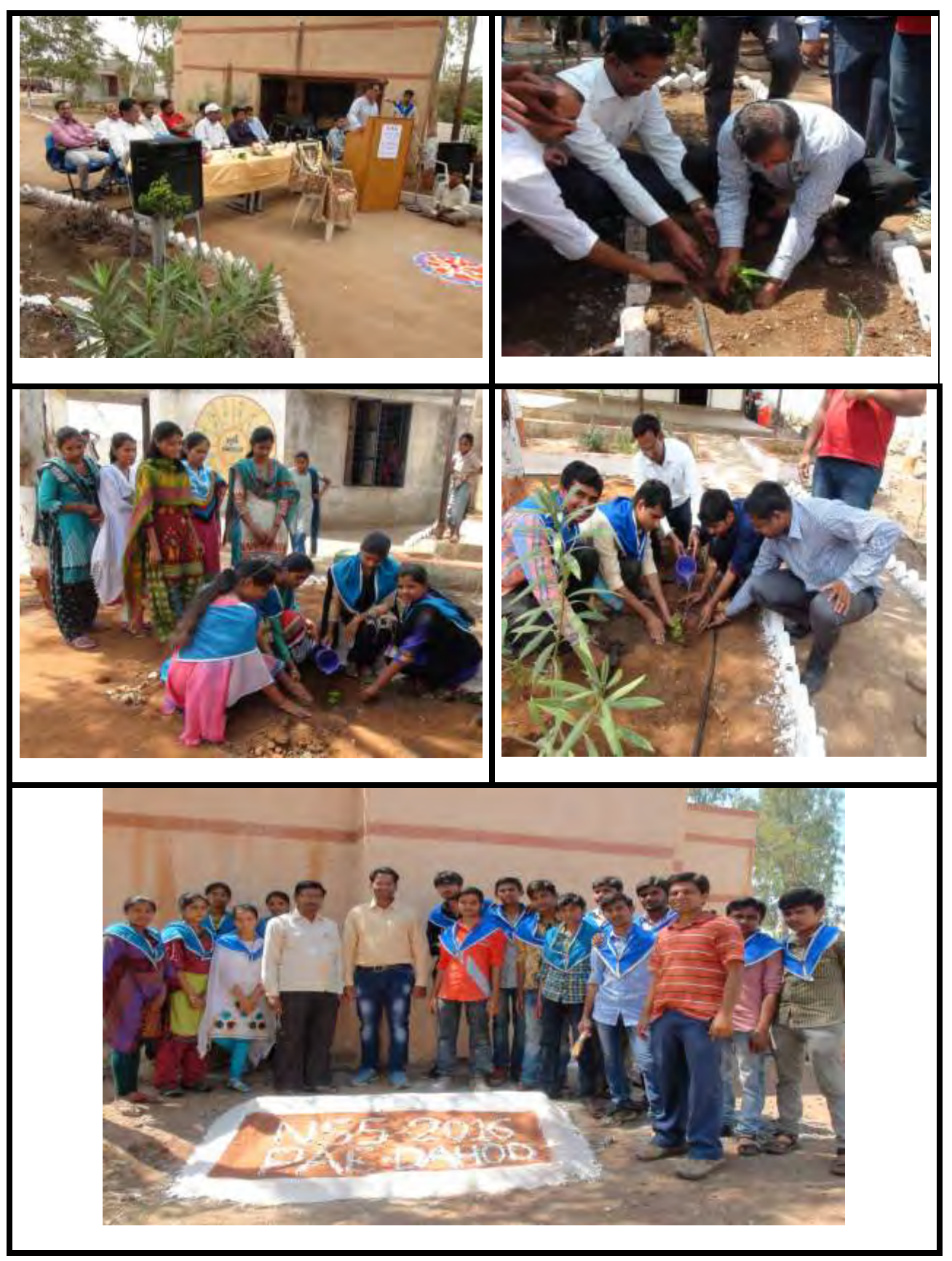
Closing Ceremony with Tree Plantation at NSS Special Camp