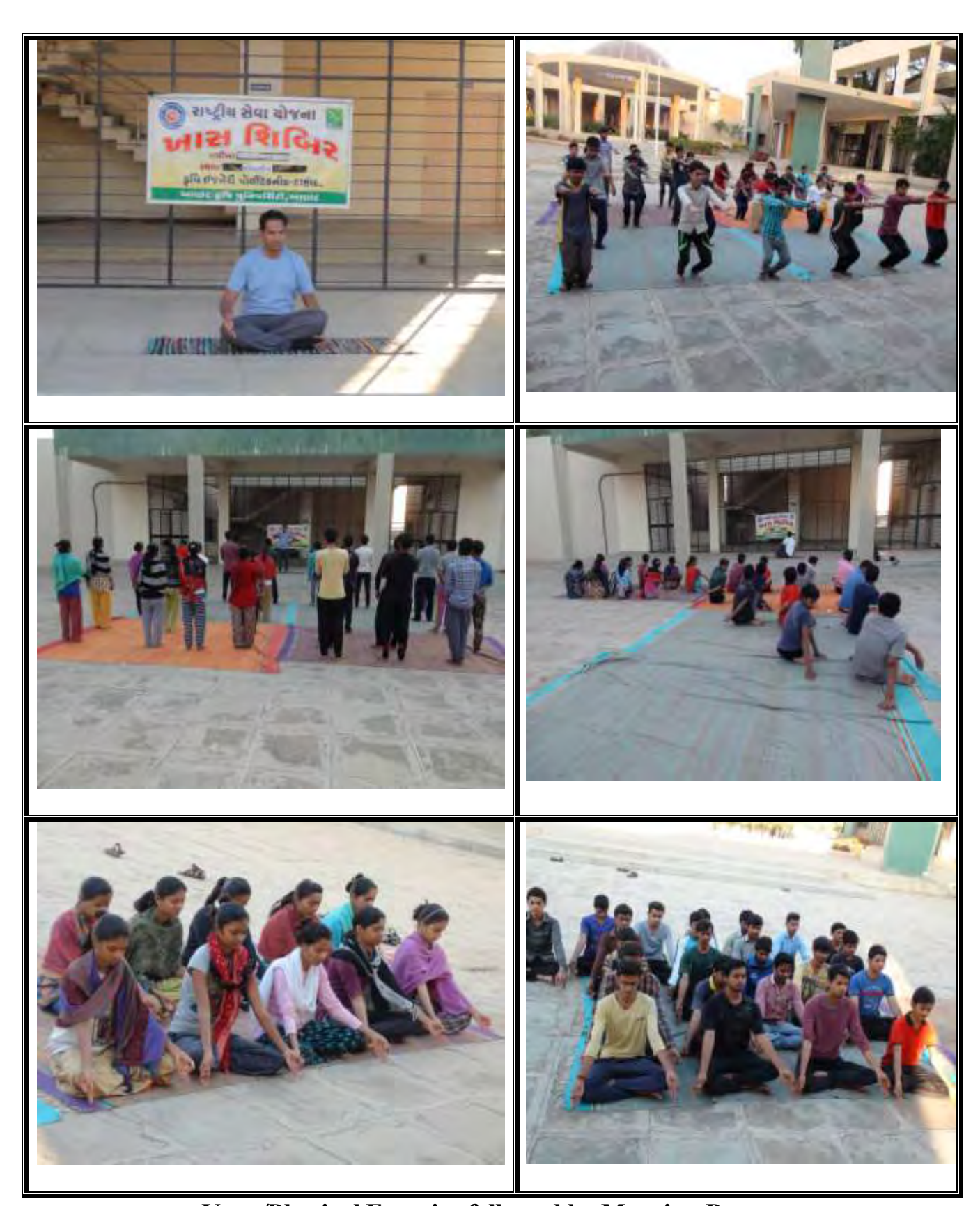
Yoga/Physical Exercise followed by Morning Prayer