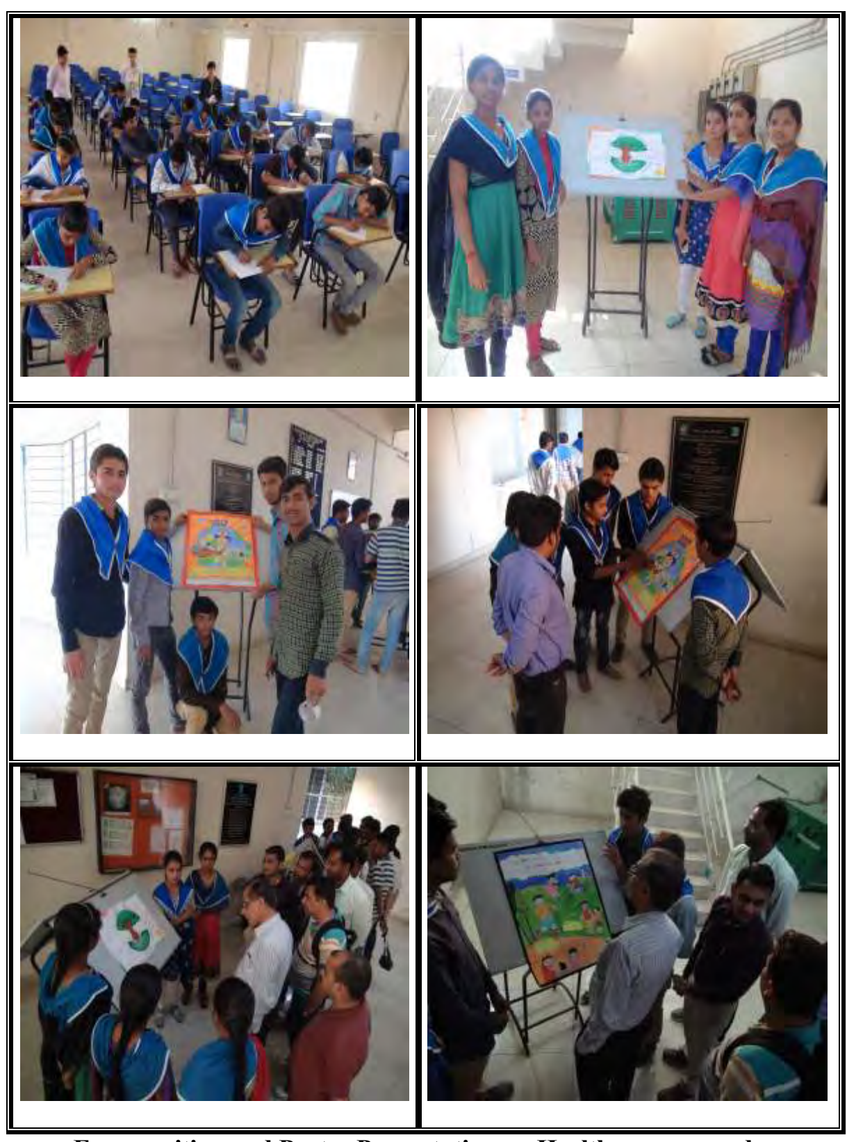
Essay writing and Poster Presentation on Health awareness day