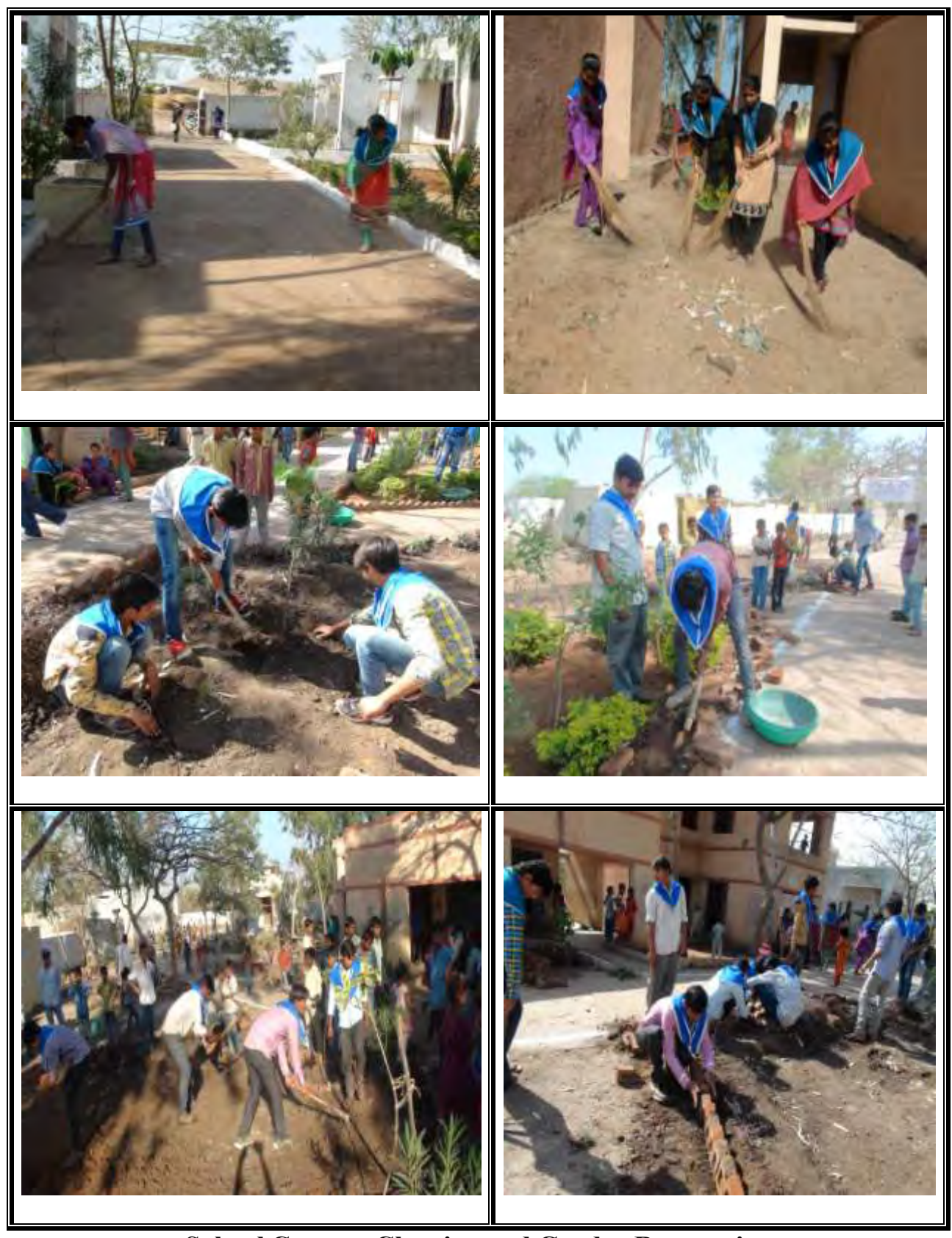
School Campus Cleaning and Garden Restoration