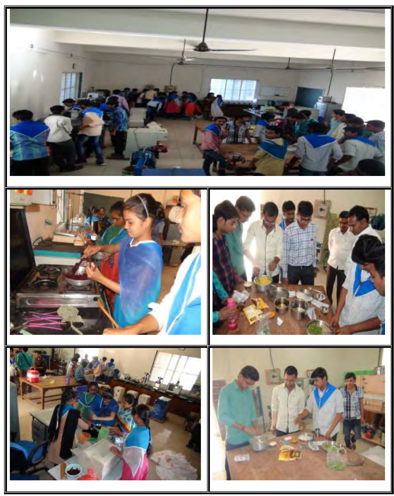
Development of Food Processed Product at NSS Special Camp