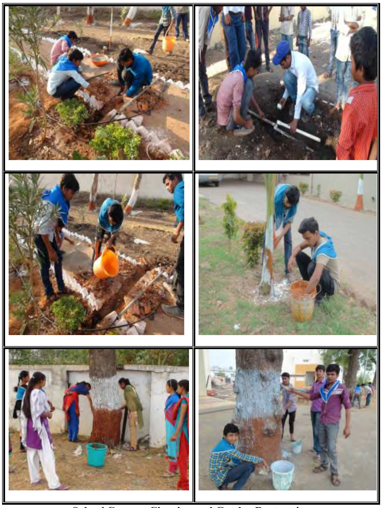
School Campus Cleaning and Garden Restoration