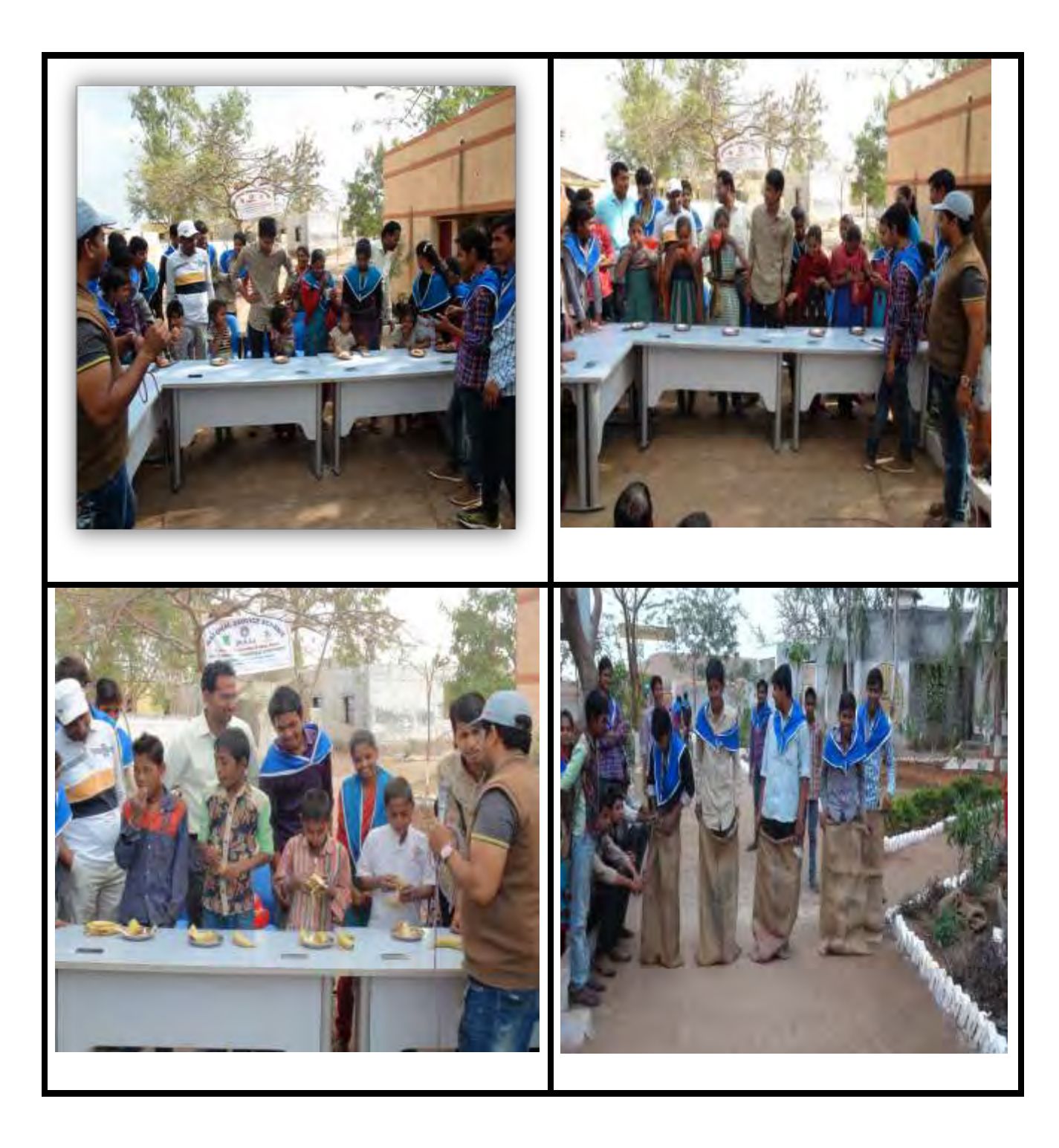
Refreshment activities at Nimnaliya School