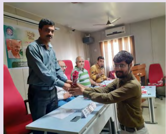
Floral welcome on the dais and off the dais