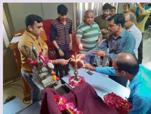
Lightening of Lamp