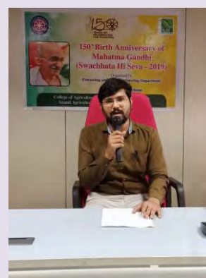
Faculties' speech on Gandhian Ideologies and Plastic waste free Environment