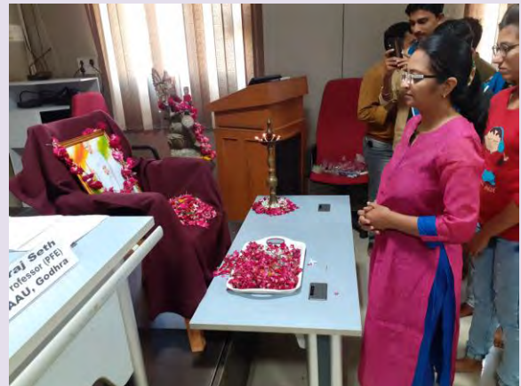
Tribute to Gandhiji on his 150 th Birth Anniversary