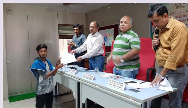
Certificate Distribution of Poster competition