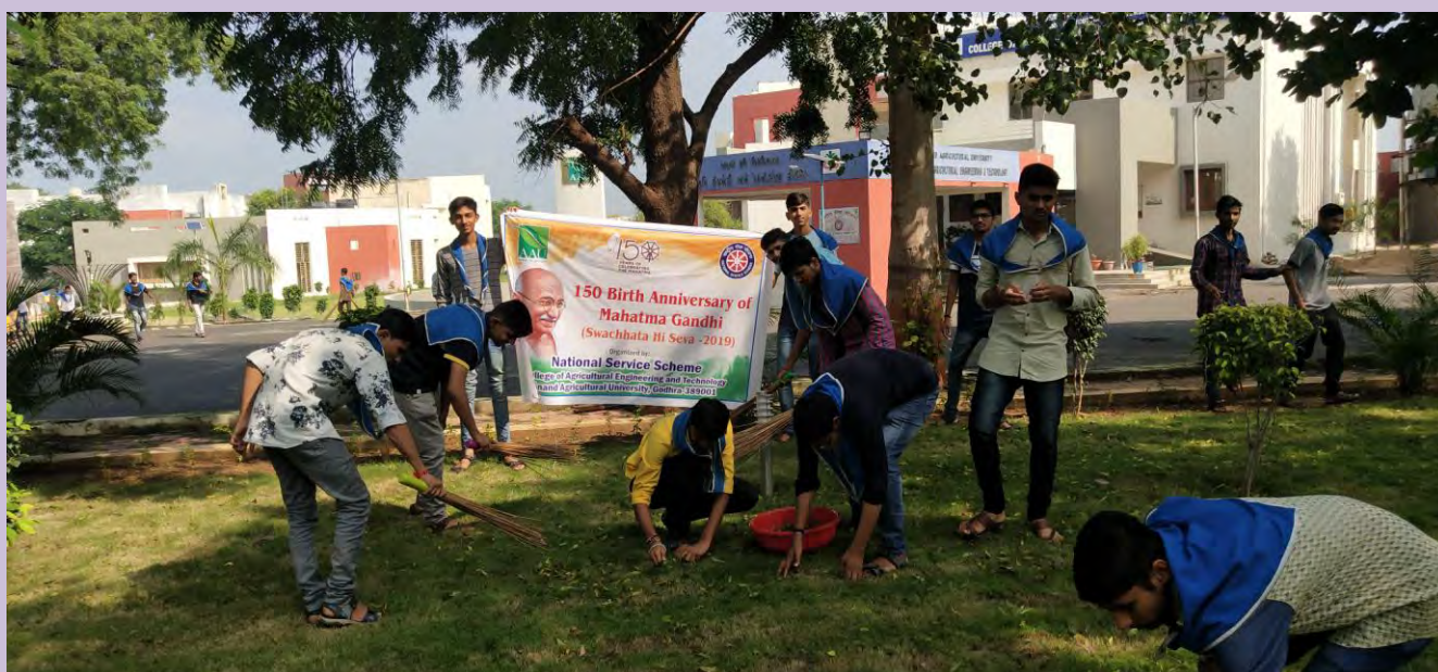
Various Shramdan activities and Cleanliness Drive by NSS Volunteers