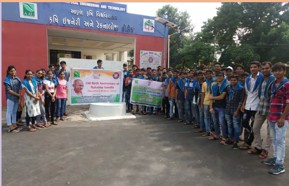
Celebration of Gandhi Jayanti by Cleanliness Drive and ShramDan