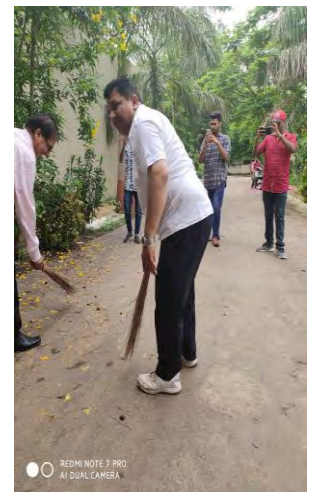
NSS volunteers, students of PAE participating in Swachhta Pakhwada Cleanliness drive