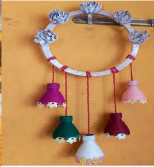
MINI GARDEN/PLANT HOLDER