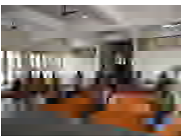
Different straching exercises