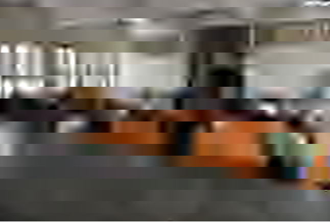
Different position of yoga