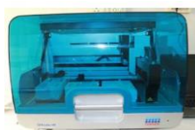
Automated DNA extractor