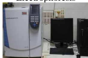
GC - FID