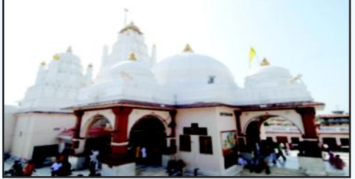
Ranchhodrai Temple, Dakor