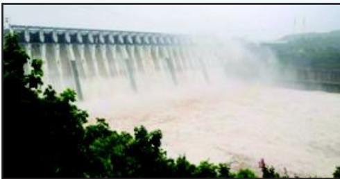
Sardar Sarovar Dam, Kevadiya