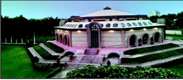
Vallabhbhai Patel & Vithalbhai Patel Memorial, Karamsad