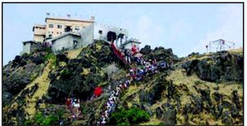
Shree Mahakali Mataji Temple, Pavagadh

Annual Conference Brochure is Published by the Indian Society of Mycology and Plant Pathology Rajasthan College of Agriculture, MPUAT, Udaipur - 313 001, Rajasthan, India