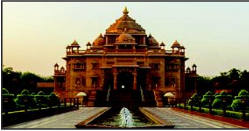
BAPS Akshardham Temple, Gandhinagar