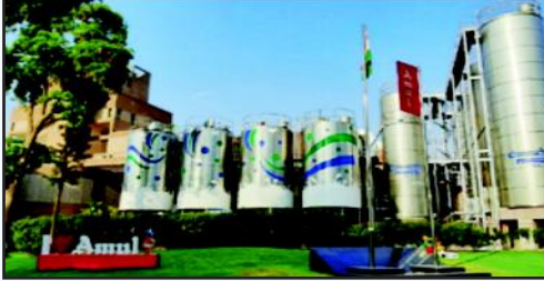
Amul Dairy, Anand