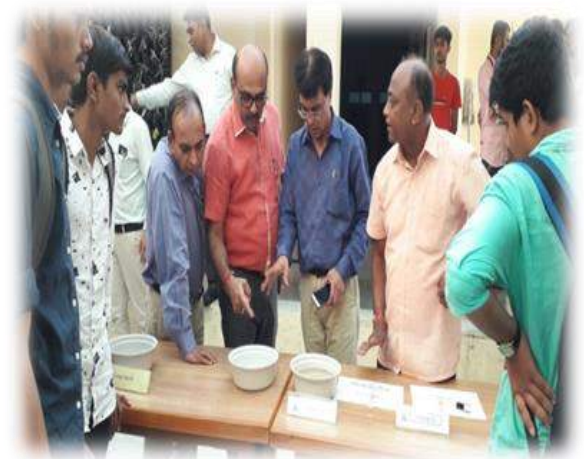
Demonstration of life cycle of such disease spreaders