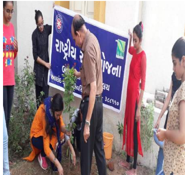
Plantation at Maniben Girls Hostel