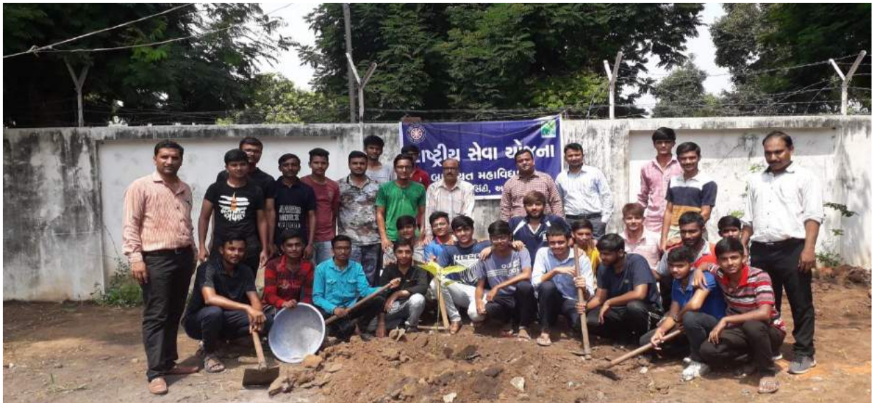
Plantation at Mahatma Gandhi Boys Hostel