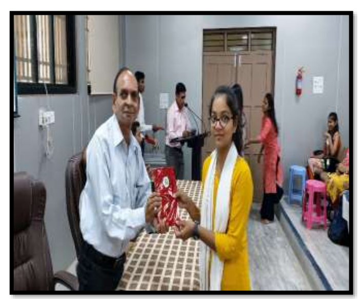
Celebration of Teacher's Day-2019