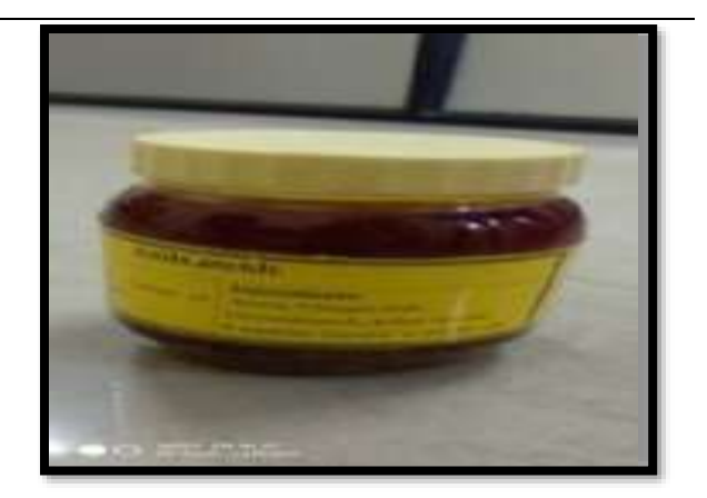
Preparation of Fruit Pickle