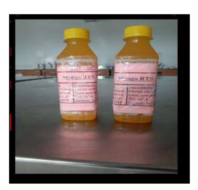
Preparation of Mango RTS