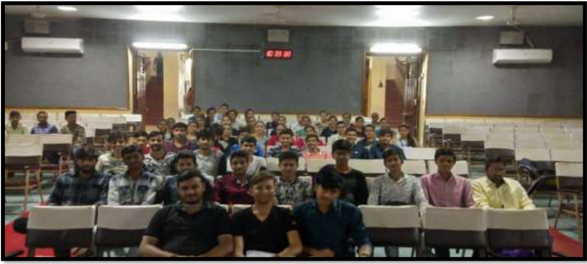
Nashabandhi Jagaruti ane Debate Programme

At University level one programme on "Nasabhandhi Jagaruti and their rules and debate" was organized jointly by AAU, Anand and Nashabandhi ane Abkari Vibhag, Anand on 2nd October, 2019. The main aim of this programme is that students can understand about new rules and regulation about Nashabandhi and how they can avoid such types of drugs drug like tobacco, alcohol etc. They also explained that