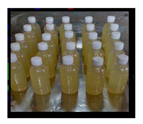
Preparation of Lime Squash