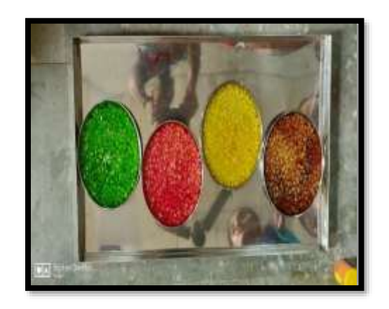
Preparation of Tutti -Frutti