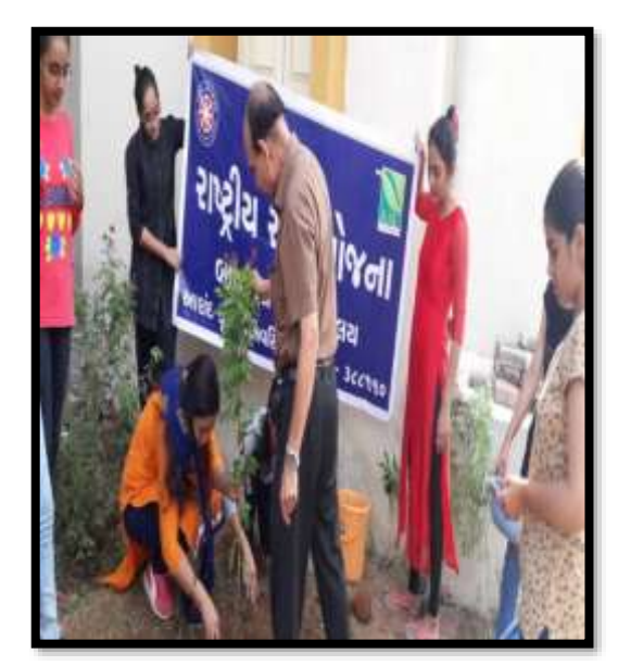
Plantation at Maniben Girls Hostel