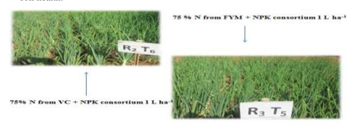
Overview of experiment

The farmers of middle Gujarat agro climatic zone growing onion organically in sapota orchard during initial years are recommended to apply either 75 kg N/ha through FYM + bio NPK consortium 1 L/ha in soil or 75 kg N/ha through vermicompost + bio NPK consortium 1 L/ha in soil for getting higher yield and net return, and maintaining soil health.