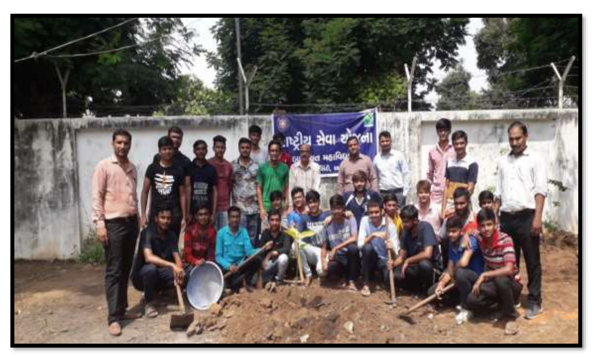
Plantation at Mahatma Gandhi Boys Hostel