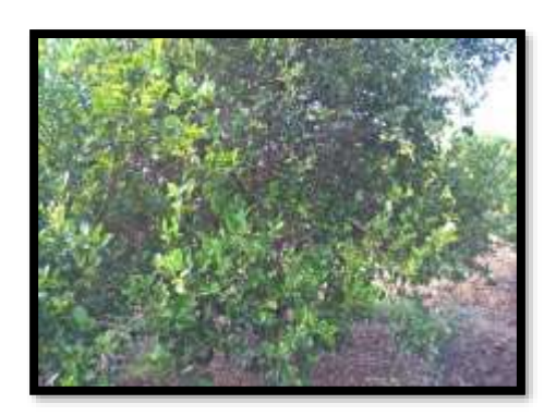
Overview of experiment