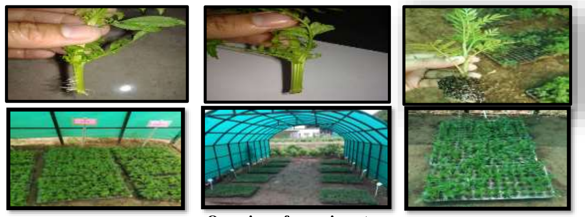
Overview of experiment