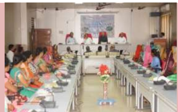
17/03/18 CAET, 50 Godhra