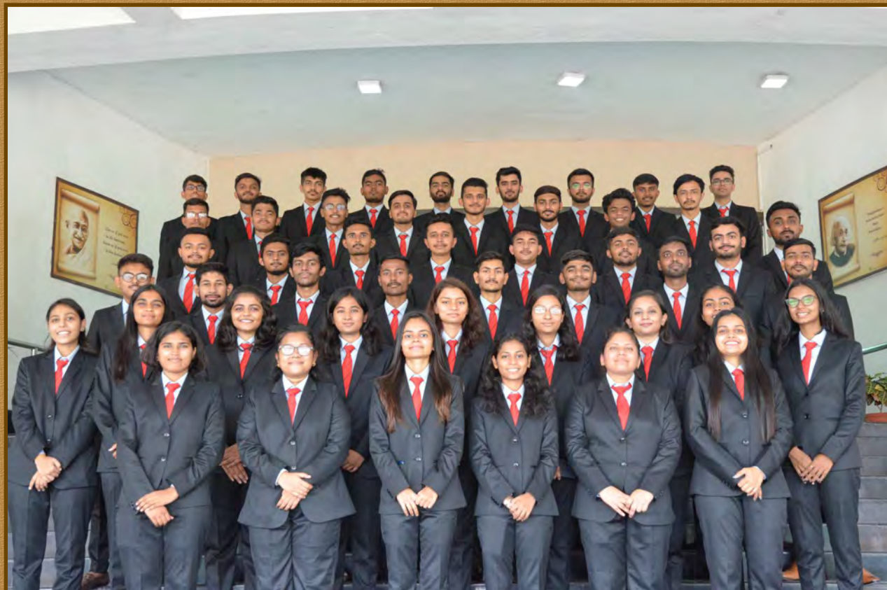
B. Tech (FT) - 2023 Batch