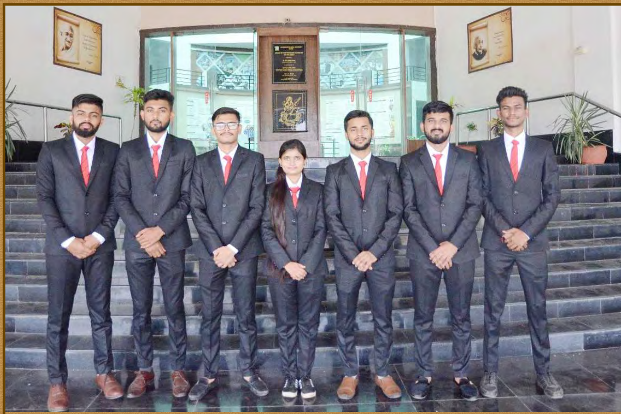
M. Tech (FT) - 2023 Batch