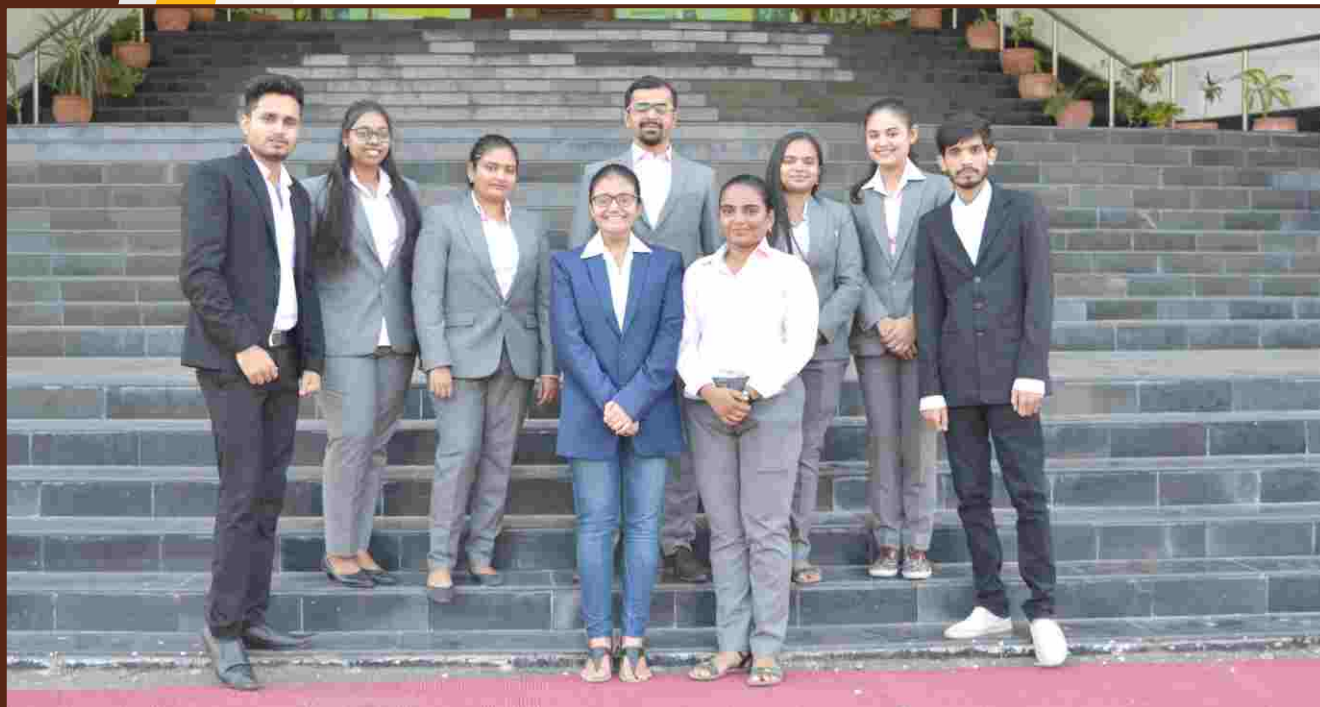
M.Tech (Food Technology) - 2019 batch