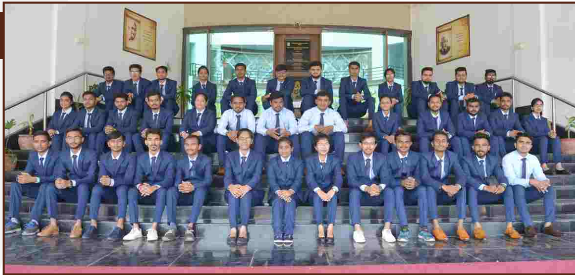
B.Tech (Food Processing Technology) - 2019 batch