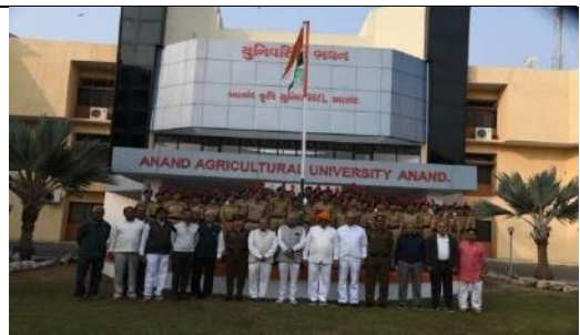
Participated in Flag Hoisting on 76<sup>th</sup> Independence Day at AAU