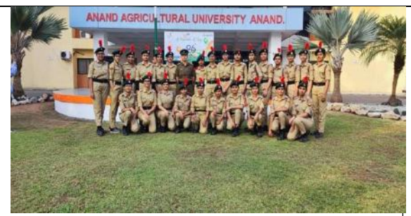
Participated in Flag Hoisting on 74<sup>th</sup> Republic Day at AAU