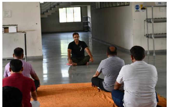
Celebration of International Yoga Day