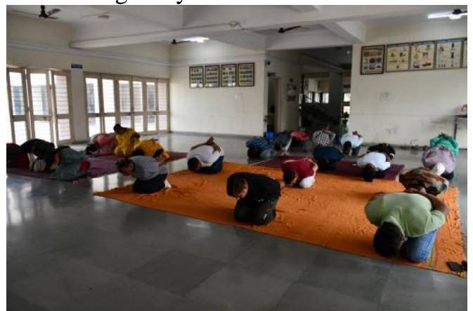
Different position of yoga