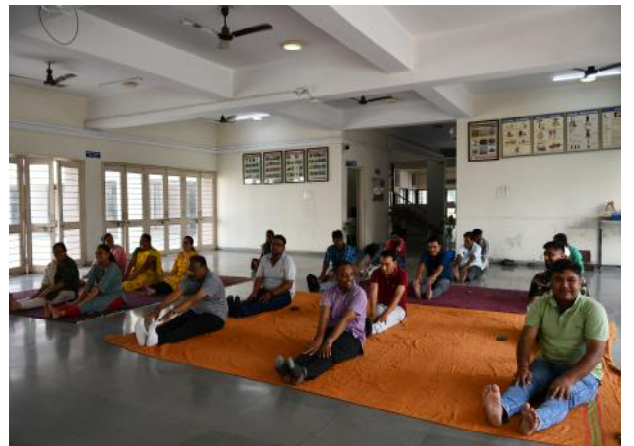
Different straching exercises