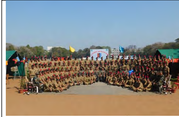
NCC cadets with Officers